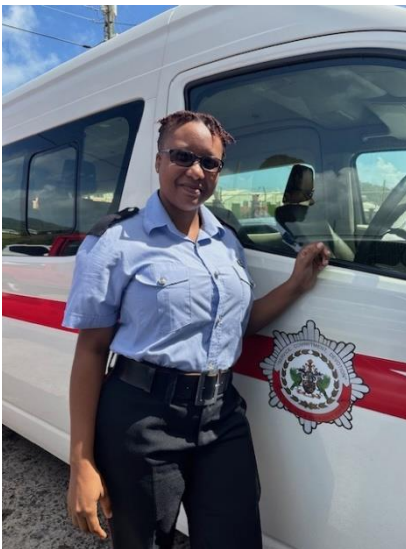
St Lucia fire and EMS service