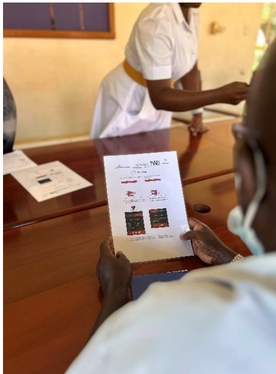
Jinja Regional Hospital, Kampala, Uganda