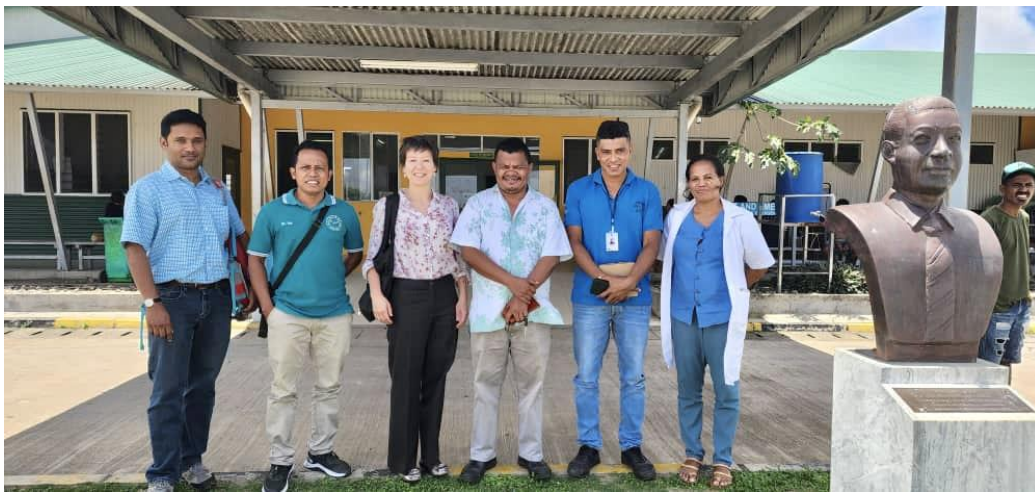
New Referral Hospital of Baucau, Timor Leste