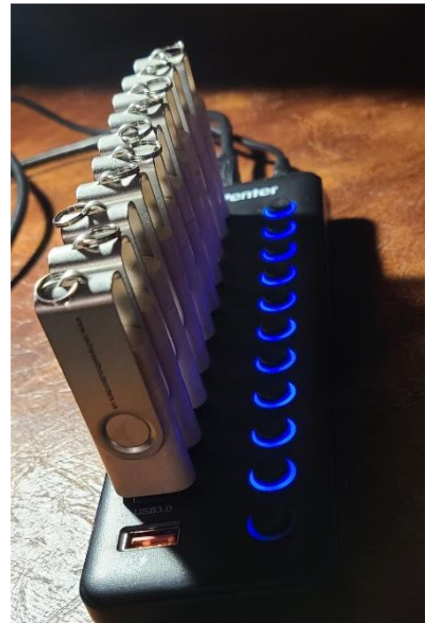
Loading USBs with CMES content

We have partnered with Humanity & Hope United, a non-profit working to assist underserved communities in remote parts of Honduras. Spanish language USBs were provided for their doctors staffing the two community health clinics in Santa Rita and Progreso, Honduras.