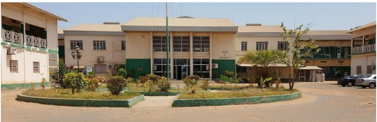
Edward Francis Small Teaching Hospital, Banjul, the Gambia